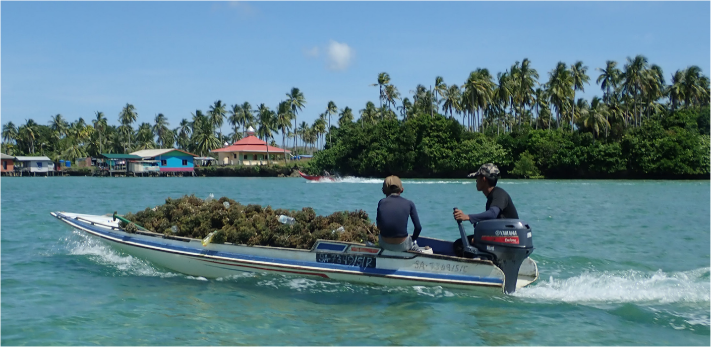
Seaweed farmers returning their harvest to shore in Malaysia.

to develop new cultivars and can improve the long-term resilience of wild stocks to climate change and other human-induced threats. They also promote seaweed habitats as areas in the ocean, which can provide a nature-based solution to ocean restoration within the ocean economy agenda and function as a key contributor to the UN Decade of Ocean Science for Sustainable Development (2021 – 2030).