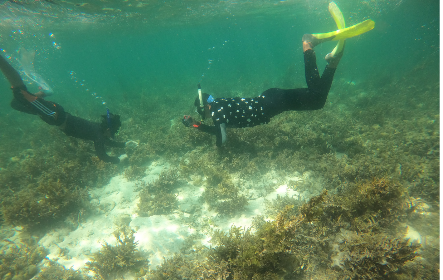
Wild harvesting of seaweeds by farmers in Malaysia.