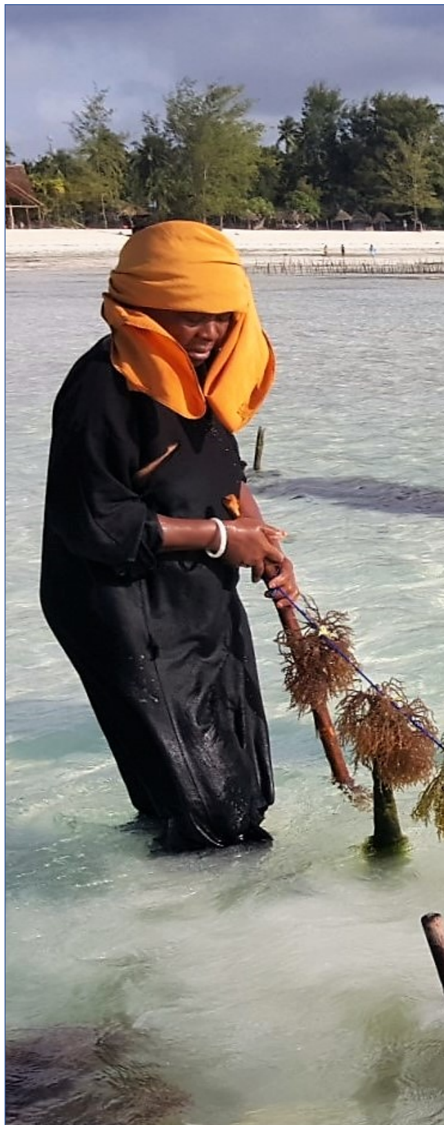
Tanzanian seaweed farmer deploying the next seaweed crop

As with any form of cultivation, the introduction and spread of seaweed pests and disease poses a major and increasing threat to production. Biosecurity helps minimise the risk of outbreaks and mitigates adverse impacts, thus protecting public health, ensuring the sustainability of the industry and safeguarding the environment. Biosecurity needs to be incorporated into government policies and regulations, as well as farm operational plans. In the context of the Progressive Management Pathway for Improving Aquaculture Biosecurity (PMP/AB), a new initiative of FAO and partners, biosecurity refers to the cost-effective management of risks posed by pathogenic agents to aquaculture through a strategic approach at enterprise, national and