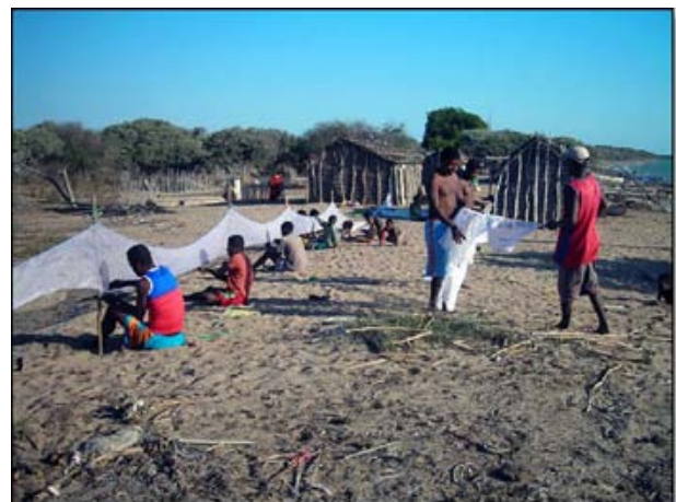
Figure 7. Families in Ambolimoke preparing nets and building their pens.