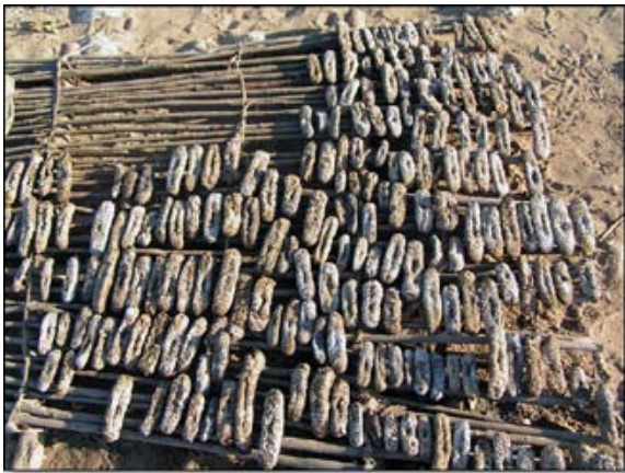
Figure 2. Wild sea cucumbers drying in a Vezo village.