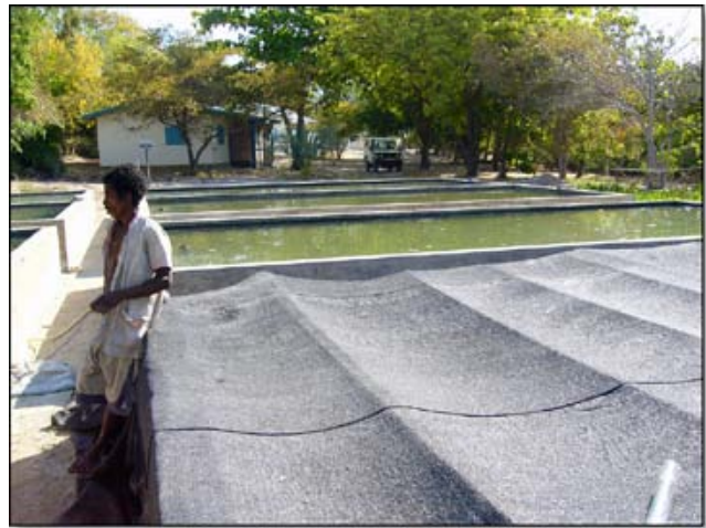
Figure 3. The sea cucumber nursery at Belaza, southwest Madagascar.