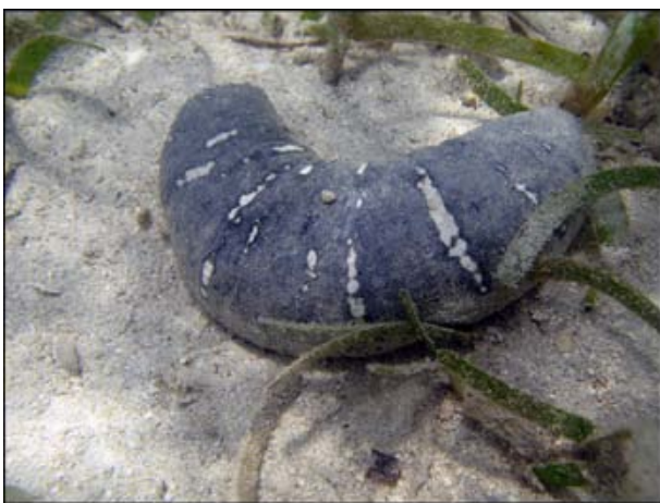
Figure 6. Commercial size H. scabra reared by the Women's Association.