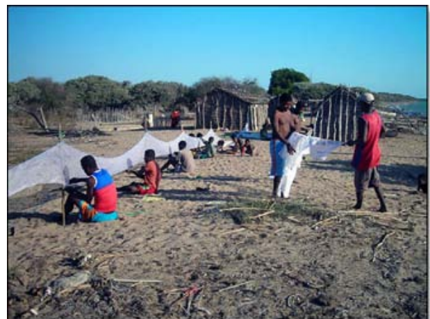
Figure 7. Families in Ambolimoke preparing nets and building their pens.