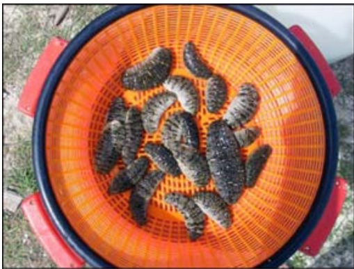
Figure 4. Hatchery-reared juvenile H. scabra .