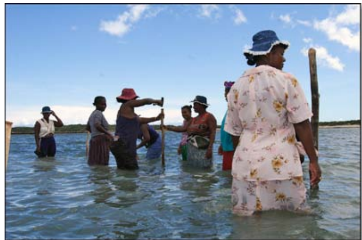
Figure 5. The Women's Association of Andavadoaka building their first pen.