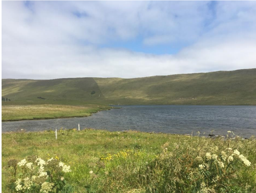
Figure 2: Loch of Hellister

The workshop went to visit a local lagoon system, the Loch of Hellister in Weisdale on the west of mainland Shetland. Key features such as water inlet and certain species (which were not thought to be lagoon specialists) were pointed out.