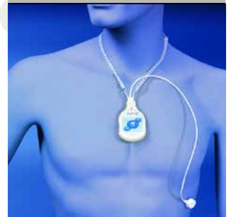
Figure 2. R-TEST monitor

Patients were identified by a member of the stroke team and referred for a R-TEST monitor (figure 2) (R-TEST 4, Novacor UK Ltd.) either