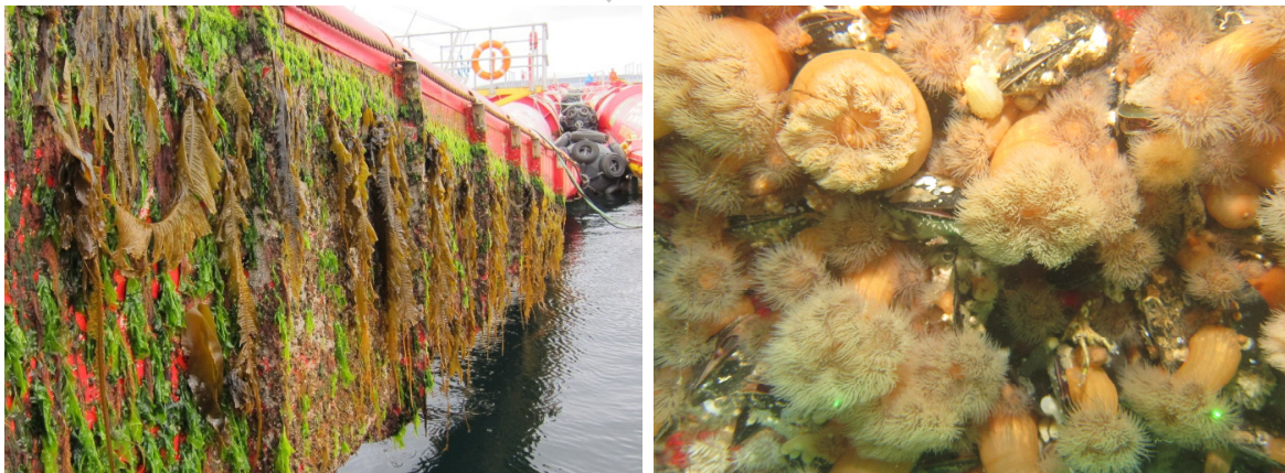
Figure 1: Biofouling community on the side (left) and underside (right) of the Pelamis P2 device. [12]

When man-made structures such as MRE devices are submerged in the sea they are colonised by a wide variety of marine organisms that form complex biological communities (see Figure 1). This marine growth, or biofouling, is unwanted from an engineering perspective as it compromises design tolerances and requires additional maintenance activities. Studies on UK marine buoys have shown that biofouling can weigh more than 33kg per square metre [5]. Det Norske Veritas (DNV) guidelines for calculating environmental loads on fixed structures predict that marine growth on oil and gas platforms can reach 132.5kg per square metre [6]. Increased structural loading caused by biofouling can often have consequences for the structural integrity, efficiency, maintenance and functioning of marine structures [7,8,9]. Artificial structures can also be colonised by non-native species [10,11,12,13], making biofouling a potential biosecurity risk and devices possible vectors for species introduction.