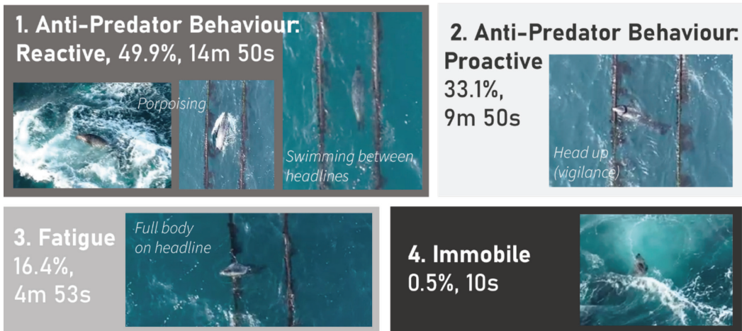
Figure 5. Example imagery of the four different states that harbour seal behaviour was categorised into during a predation event on a harbour seal around mussel farm infrastructure. Also described is the total time spent in that behavioural state, with the percentage value representing the proportion of the total encounter that the harbour seal spent in that behavioural state (m = minutes; s = seconds).