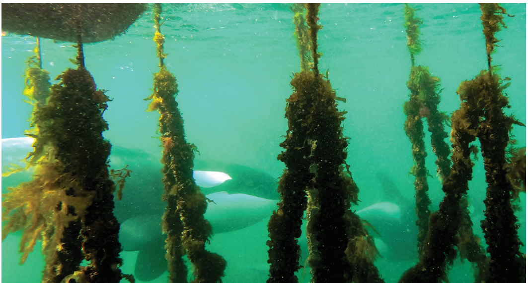
Figure 6. Two members of the 27s killer whale group swimming parallel to mussel farm headlines; this photo was taken at a mussel aquaculture site in Muckle Roe, Shetland, on 10 April 2021 (N. McCaffrey, unpub. data., 2021).

A more strategic investigation into the frequency and type of sightings of marine mammals