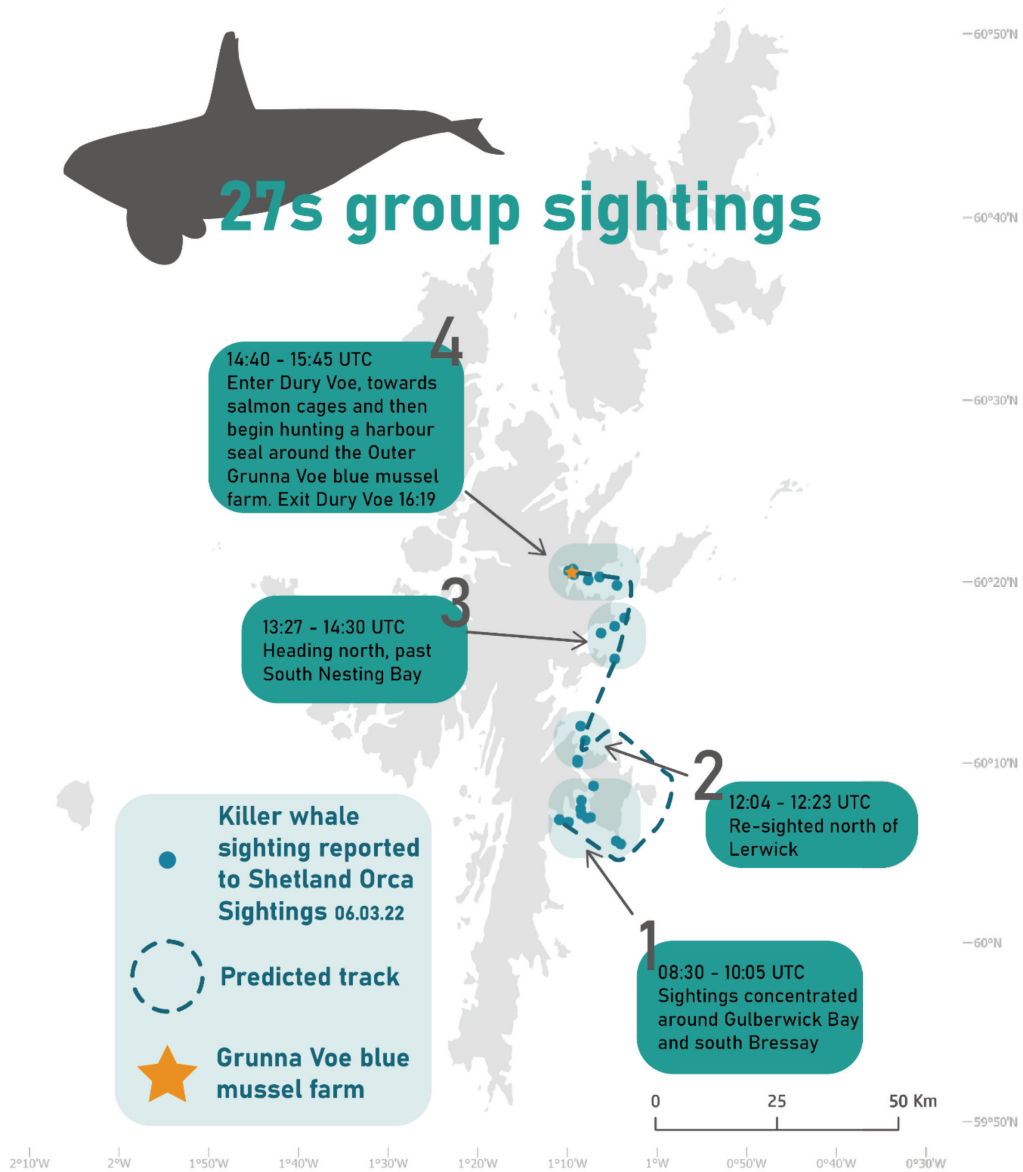
Figure 1. Sighting of the 27s group of killer whales ( Orcinus orca ) around the Shetland Isles on 6 March 2022, showing their predicted track throughout the day. Sightings data are from the local sightings networks (“Shetland Orca Sightings” Facebook page and the WhatsApp “Shetland Cetacean Group”).

8- to 10-m-long dropper lines, spaced 0.5 m apart, which are the site of mussel mariculture (either spat collection or mussel growth to adulthood; at this location, lines were collecting spat; M. Laurenson, pers. comm., 1 April 2022). The dropper lines form a continuous loop back to the headline, with 18 to 27 m between the seabed and the dropper lines (site depth: 28 to 25 m).