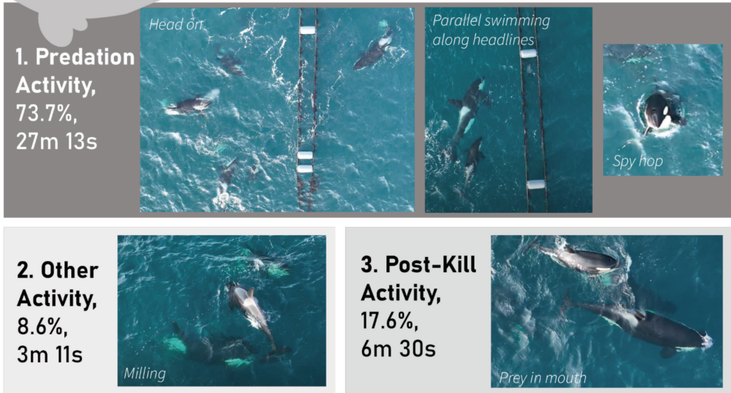
Figure 4. Example imagery of the three different states that killer whale group behaviour was categorised into during a predation event on a harbour seal around mussel farm infrastructure. Also described is the total time spent in that behavioural state, with the percentage value representing the proportion of the total encounter that the killer whales spent in that behavioural state (m = minutes; s = seconds).