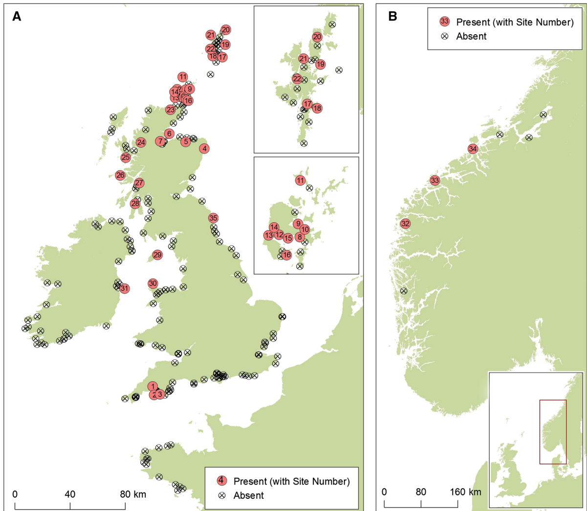
Fig. 1 Maps of Schizoporella japonica presence and absence in Great Britain, Ireland, the Isle of Man and France (a) and Norway (b). Insets in a show Orkney (bottom) and Shetland (top). Filled circles indicate presence records with site numbers

as designated in Table 1. Hollow circles with crosses indicate absence records. See the Supplementary information for full details of presence and absence records