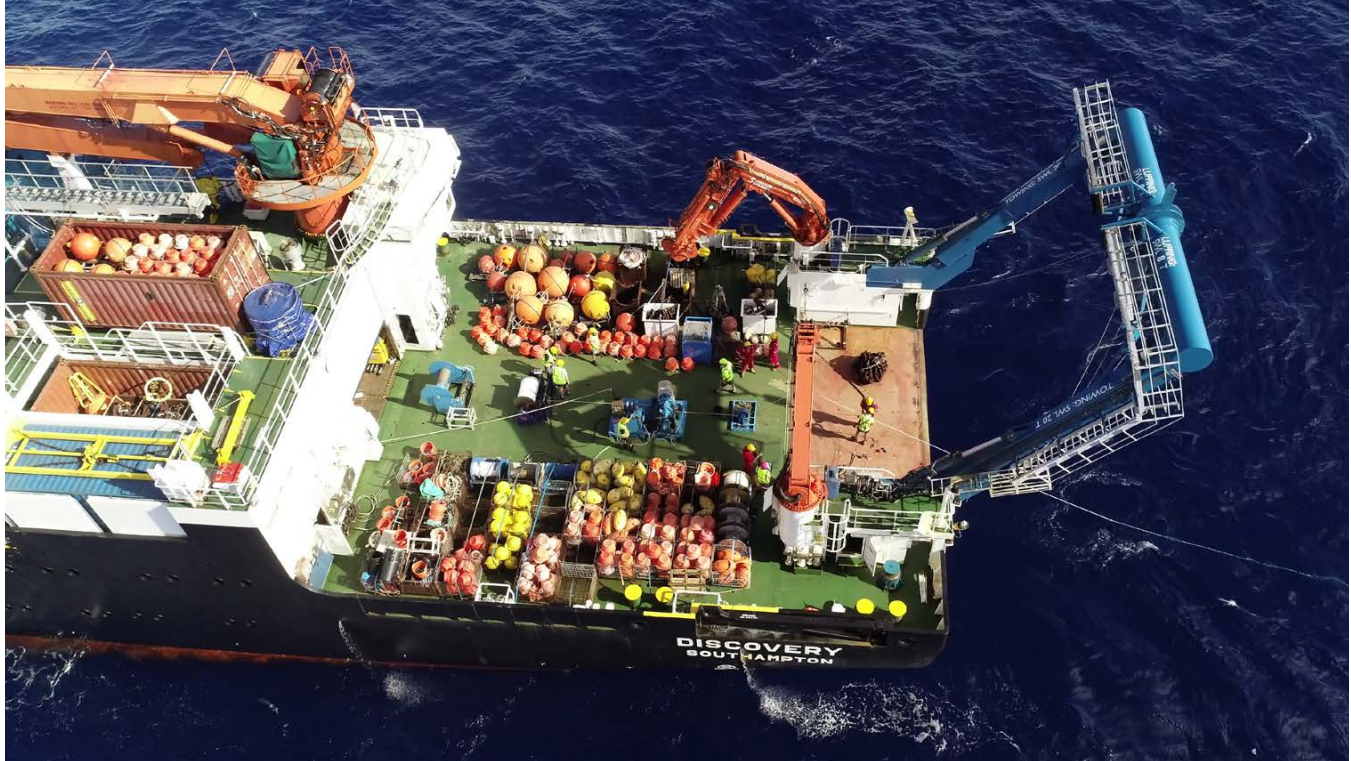
FIGURE 2. An Atlantic mooring is deployed from RRS Discovery during cruise DY129 in early 2021.

expendable bathythermographs, and Argo floats (Frajka-Williams et al., 2019; Østerhus et al., 2019).